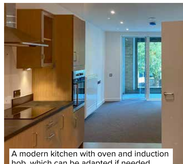
A modern kitchen with oven and induction hob, which can be adapted if needed