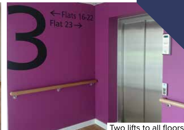
Two lifts to all floors