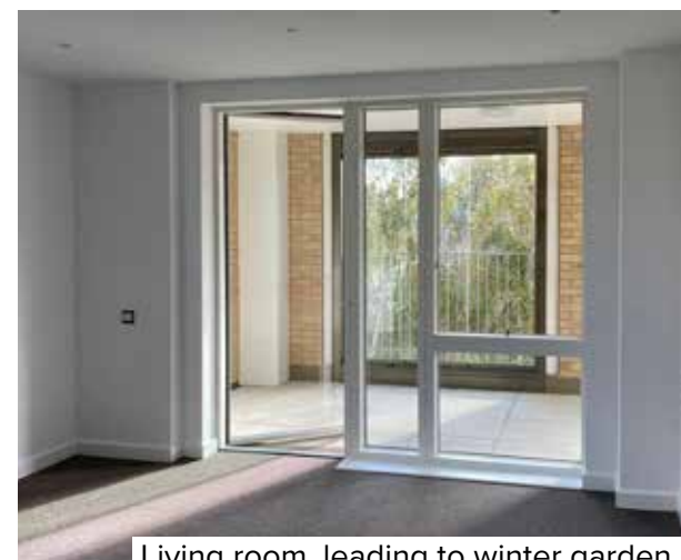
Living room, leading to winter garden