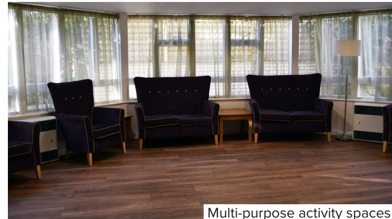
Multi-purpose activity spaces