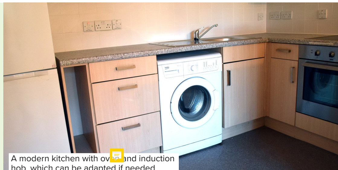
A modern kitchen with oven and induction hob, which can be adapted if needed