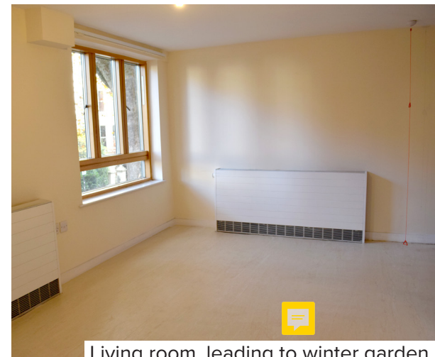
Living room, leading to winter garden