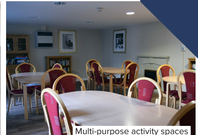
Multi-purpose activity spaces