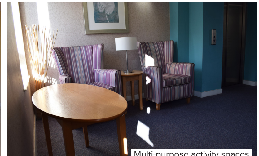
Multi-purpose activity spaces