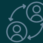
Willingness to engage