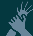
First physical assault