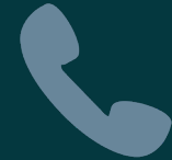
Monitoring (phone checking, questioning children on partner's activities)