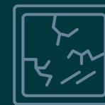
Damage to property