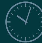
Early signs of controlling behaviours (e.g. isolation from friends/family, made to account for time)