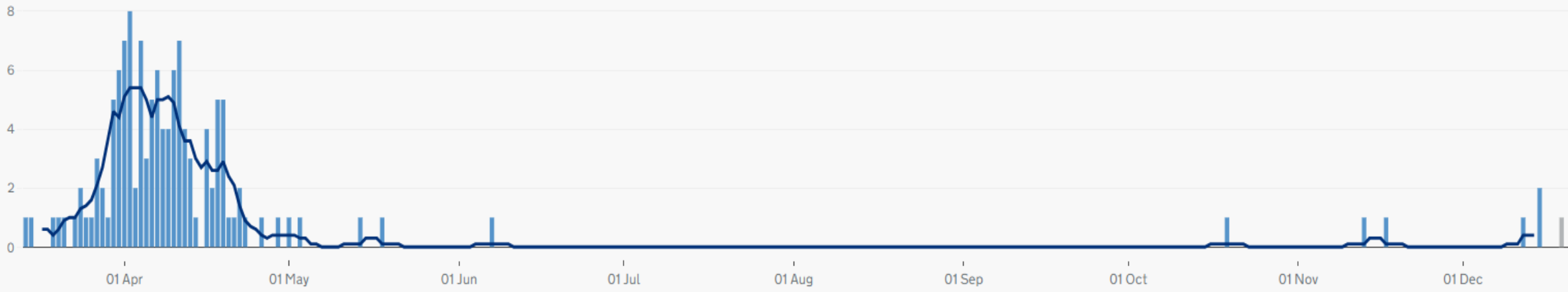
Most recent 5 days (incomplete) Number of deaths Deaths (7-day average)